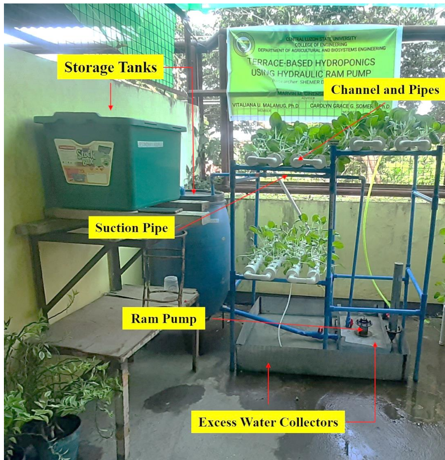
Figure 3. Fabricated terrace-based hydroponics system using hydraulic ram pump